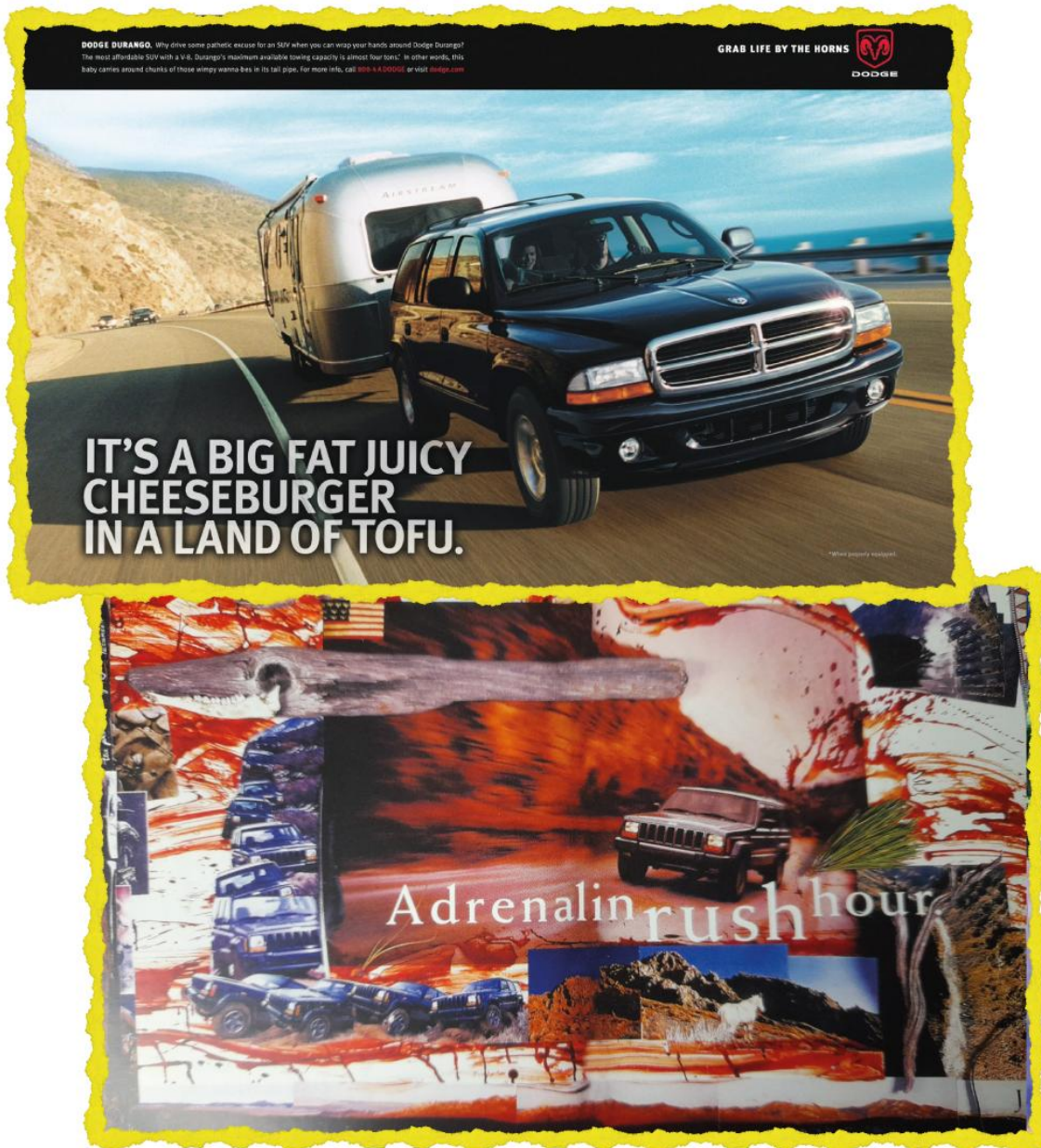
Dodge Durango ad (top) and Jeep Cherokee ad (bottom).

We realise their tongue was firmly in the cheek, but fomenting strife between town and countryside feels more dangerous a decade later.