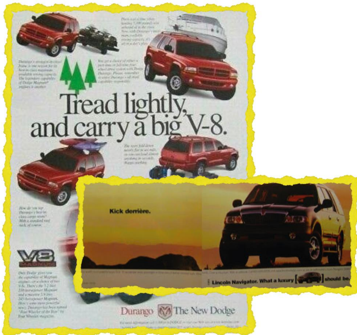
Dodge Durango "Tread lightly" V-8 print ad, 1998; Lincoln Navigator "Kick derrère" print ad, 1999.

Like the Blazer above, campaigns for Hummer and Jeep were increasingly shot from a position just below the front bumper: we are made to feel prostrated before the vehicles.