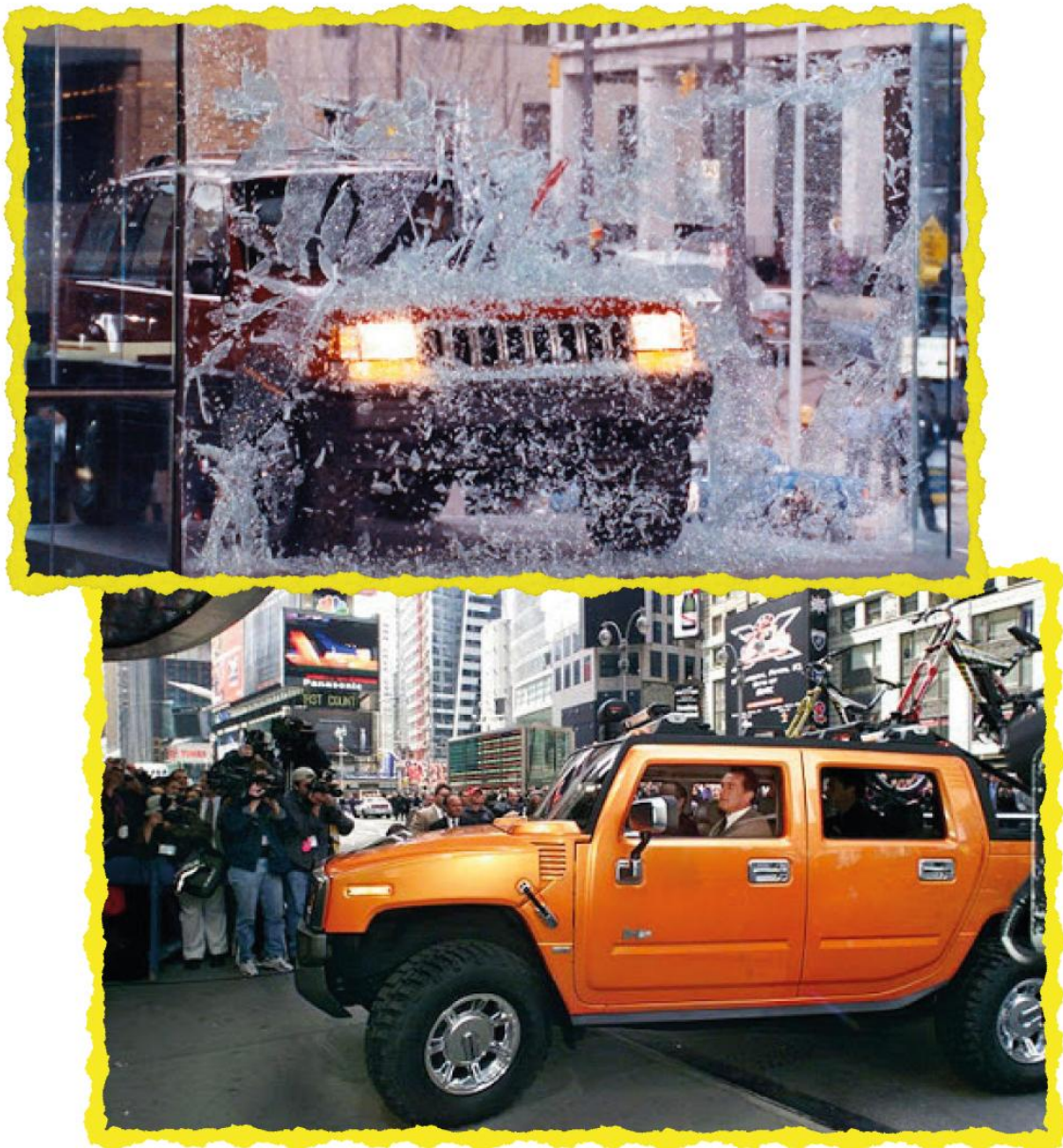
Ford Explorer launch at Detroit auto show in 1992; Arnold Schwarzenegger unveils the new Hummer H2 in downtown Manhattan in 2001.