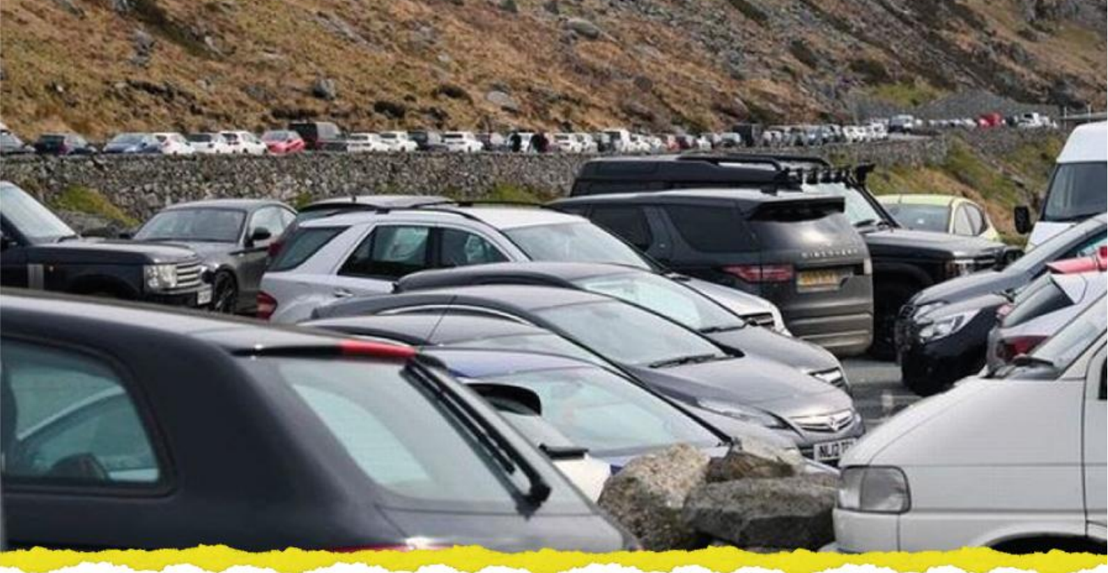
Cars parked at the base of Mount Snowdon, Wales, 2020.

nowhere. Sometimes in the middle of nowhere you find yourself.” [Hummer, 2001]. 57 This may be true of course, but not at the wheel of a car.