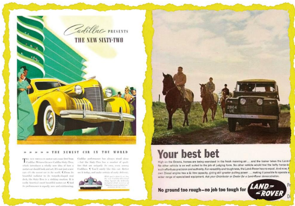
1939 Cadillac advert and 1961 Land Rover promotion