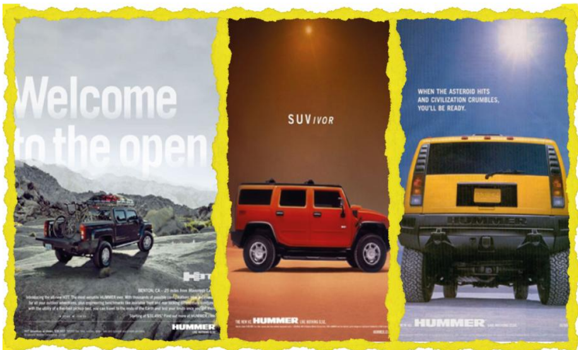
A selection of Hummer ads referencing survival in the rugged outdoors.

In 2018, advertising agency BBH London won an award for their ‘clown’ campaign, persuading viewers that their Audi could help them navigate the peculiar hazards of other drivers. 78 One Los Angeles Hummer driver was asked why he bought it. He replied: “I call this my urban escape vehicle,” he answered. “Fires, earthquakes, riots. I’m ready.” 79